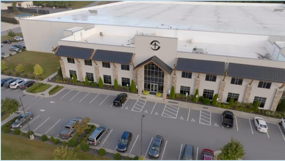
Samaritan's Purse Logistics Warehouse Wilkesboro, North Carolina (Developing warehouse pharmaceutical inventory capability)