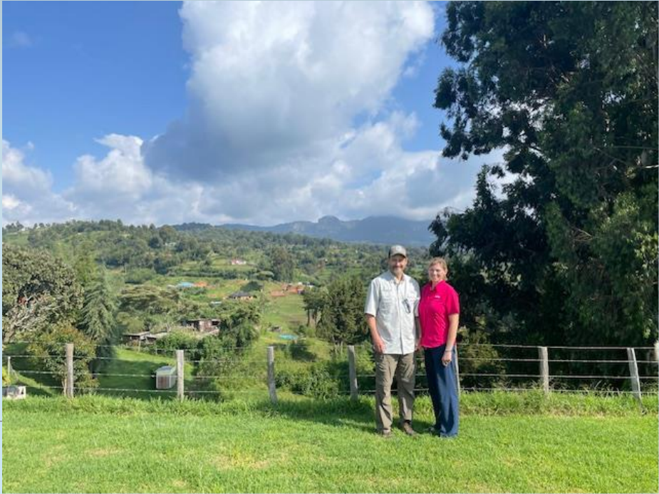
Kapsowar Hospital, June, 2023.