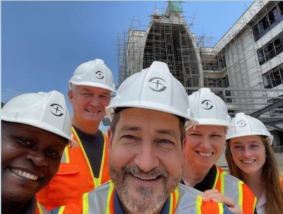
New Cardiothoracic Center: Tenwek Hospital, Kenya