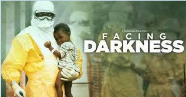
Ebola Epidemic in West Africa, 2014.