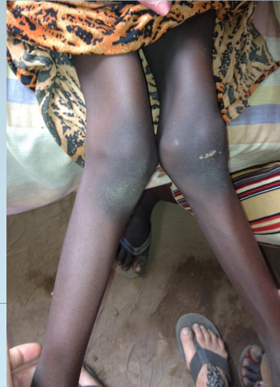
Disease Process? Rickets