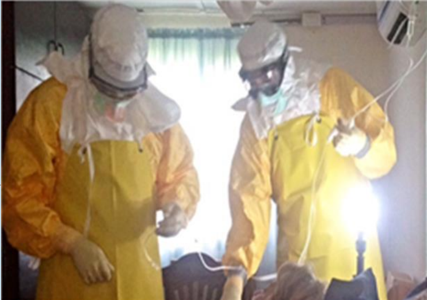
First humans to be administered the experimental antiviral ZMapp.