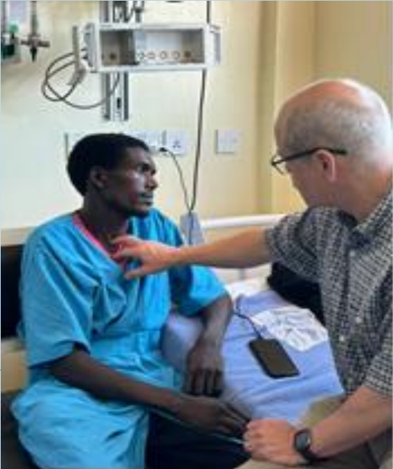
Aspirin in lieu of Anticoagulation for Mechanical Heart Valves in Rheumatic Heart Disease