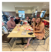
Dinner and Fellowship Time