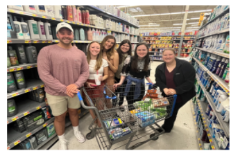
Shopping at Walmart