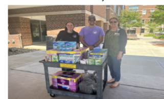
Delivering the Supplies