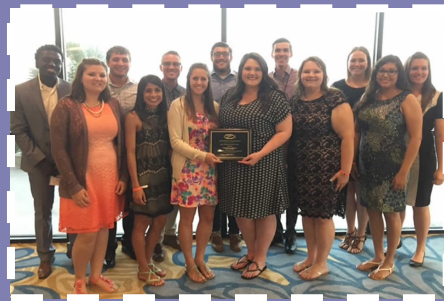
The CPFI Student Chapter of the Year Award, which recognizes the outstanding achievements of a CPFI student chapter, was awarded to Southwestern Oklahoma State University.